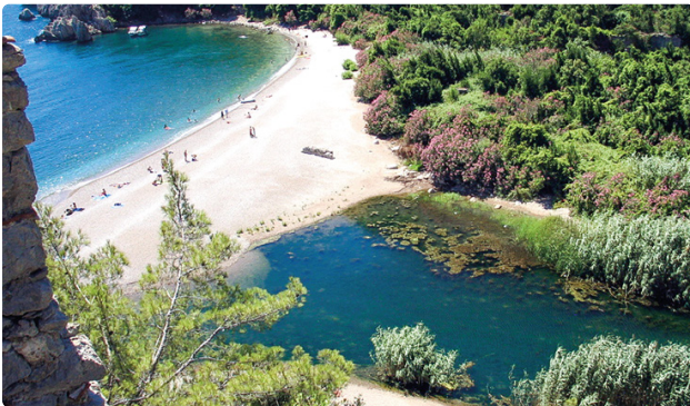
Olympos - Yanartaş