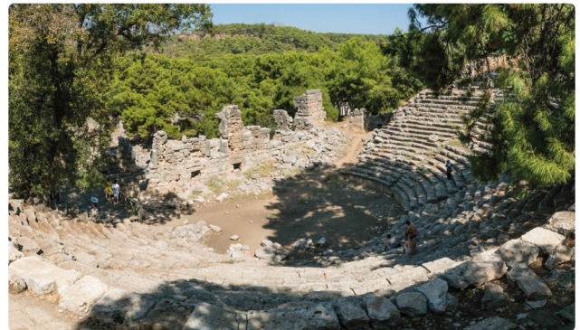
Phaselis Antik Kenti